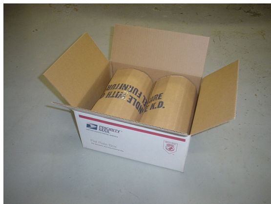
figure 4 – pack ends with paper and place into box