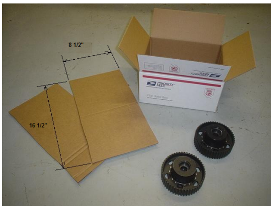
figure 1 – two strips of cardboard 8½" wide x 16½" long

Please fill out and include a Core Credit Refund sheet, which you can download at: http://bde-performance.com/cores.htm